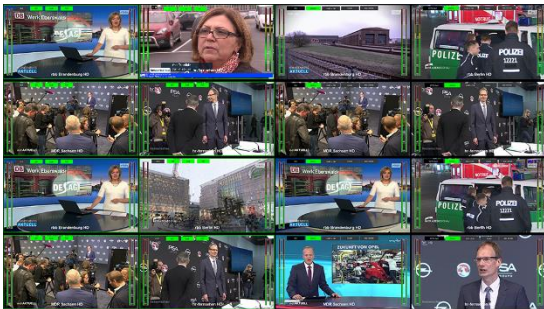
Create your own screen design

Simplify monitoring and don't lose sight of anything. Show classic signals and Over the top content (OTT) on one screen. Save different screen designs and switch between them. Switch between different screen designs automatically in conjunction with the BOSS BROADCAST Manager.