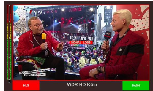
Pop-up alarm notifications