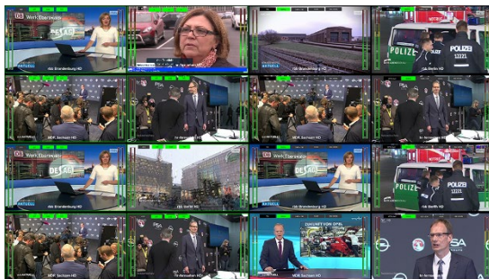
Create your own screen design

Simplify monitoring and don't lose sight of anything. Show classic signals and Over the top content (OTT) on one screen. Save different screen designs and switch between them. Switch between different screen designs automatically in conjunction with the BOSS BROADCAST Manager™.