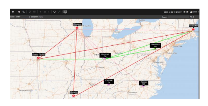
Graphical View in Monitor Mode