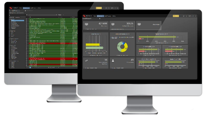
BOSS MEDIA Exchange dashboard and monitoring

BOSS Media Exchange supports multisite structures. This allows files to be managed at multiple locations and to be shared between them. This makes it very easy and convenient to work across locations. No longer, media-workflows are restricted to the private network – external partners who require access can be registered and use BME as one exchange platform, triggering subsequent workflows after ingesting a file. Thanks to the flexible software architecture, it can grow with you at any time. Individual services can be independently added to the overall system.