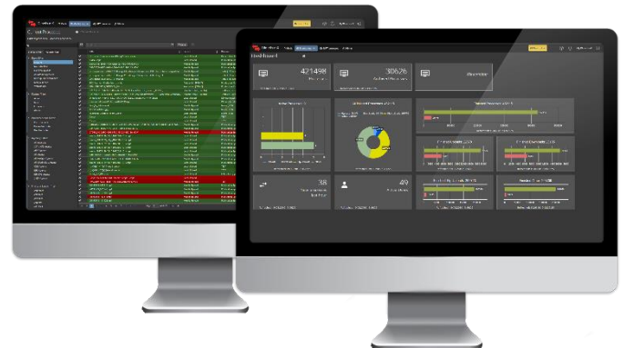
BOSS MEDIA Exchange dashboard and monitoring

BOSS Media Exchange supports multisite structures. This allows files to be managed at multiple locations and to be shared between them. This makes it very easy and convenient to work across locations. No longer, media-workflows are restricted to the private network – external partners who require access can be registered and use BME as one exchange platform, triggering subsequent workflows after ingesting a file. Thanks to the flexible software architecture, it can grow with you at any time. Individual services can be independently added to the overall system.